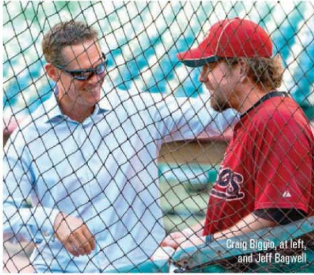
Craig Biggio, at left, and Jeff Bagwell