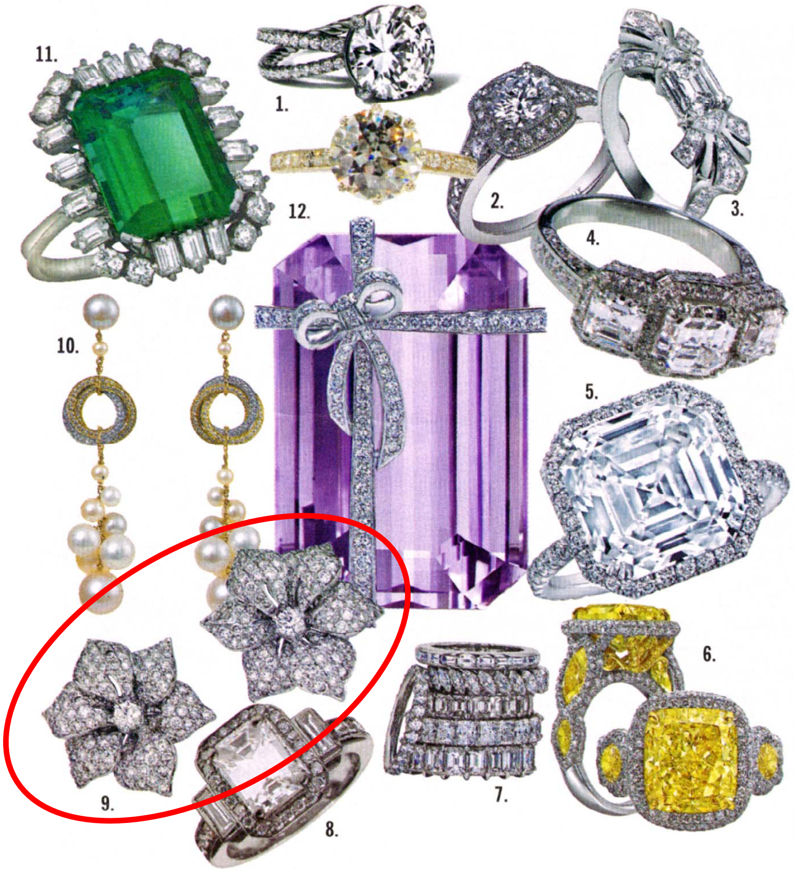
1. David Yurman. 2. Zadok Jewelers. 3. Van Cleef & Arpels. 4. I.W. Marks. 5. Deutsch & Deutsch. 6. Lewis Jewelers. 7. Tenenbaum & Company. 8. Queen of Heirs Jewelry. 9. DeVile Fine Jewelry. 10. Cartier. 11. Past Era Antique Jewelry 12. Wayne Smith Jewelry. 13. Tiffany & Co.