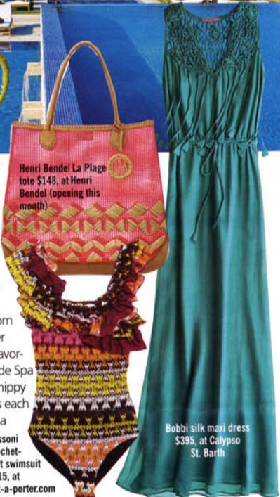
Henri Bendel La Plage tote $148, at Henri Bendel (opening this month)