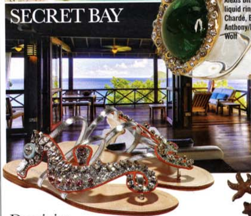
Alexis Bittar gold liquid ring $275, at Chardé, Elizabeth Anthony/Esther Wolf