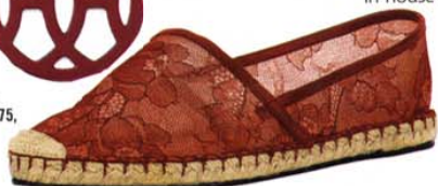
Valentino lace espadrilles $475, at Valentino