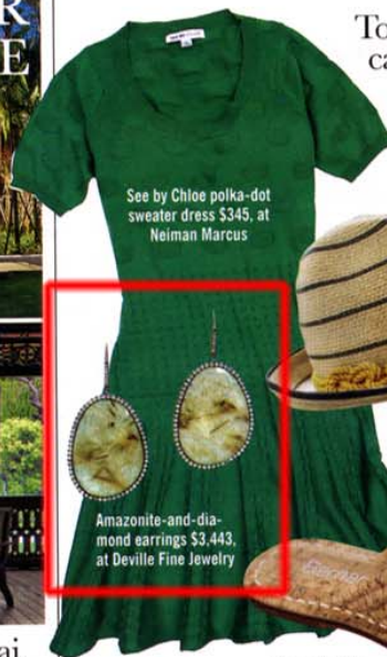
See by Chloe polka-dot sweater dress $345, at Neiman Marcus