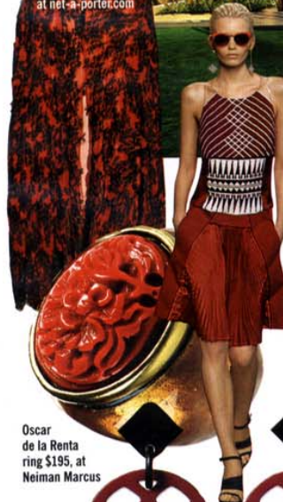
Rosamosario Rosso Disera lace-appliqued silk chemise $1,820, at net-a-porter.com