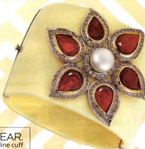
A CROSS TO BEAR. Bakelite and tourmaline cuff $6,650, at DeVille Fine Jewelry.