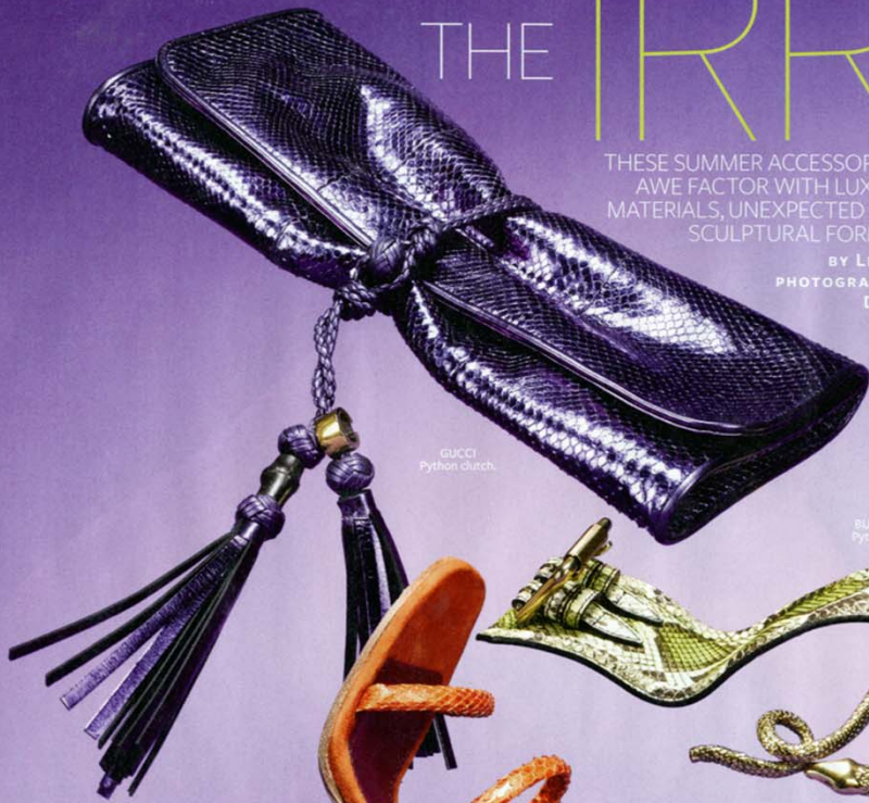
GUCCI Python clutch.